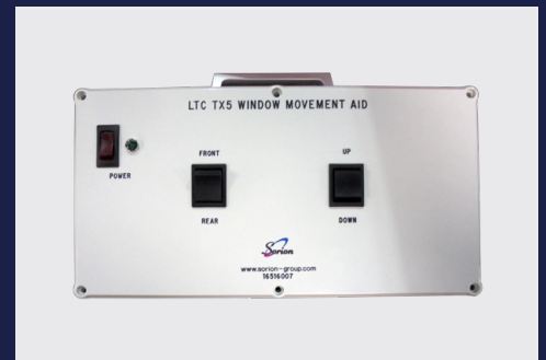
Window movement aid