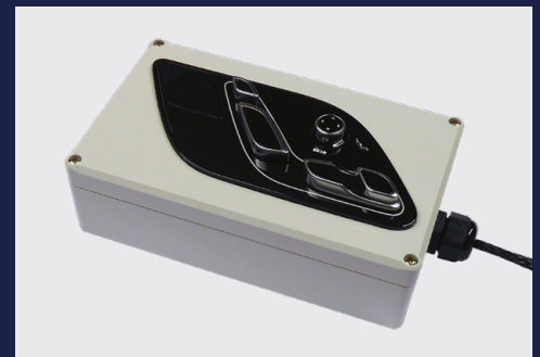
Seat movement aid