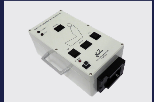
Seat sub-assembly movement aid