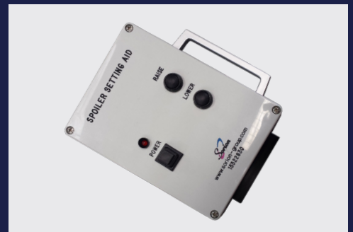
Spoiler setting aid