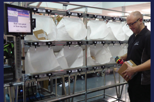
Order sorting system