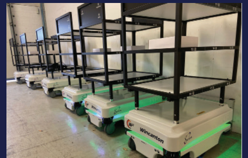
Order fulfilment system