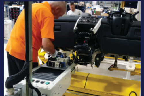
Automotive cockpit end of line test stations