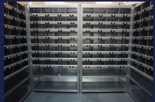
Label sorting rack with 120 slots