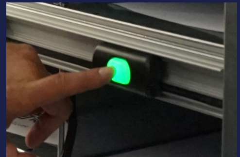
Pick to Light module