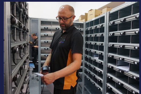
Label sorting and retrieval system

Tel: 0121 454 8966 Email: sales@sorion.co.uk www.sorion.co.uk