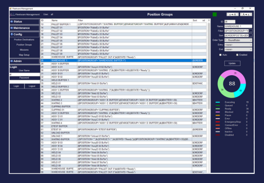
Central configuration of a fleet of robots