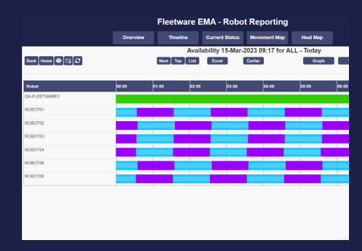
Event timeline - can be used to identify bottlenecks