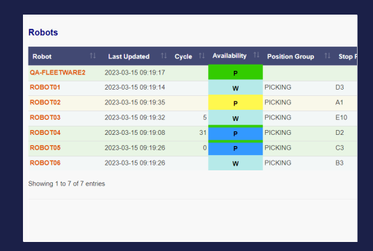
Colour coded robot status information